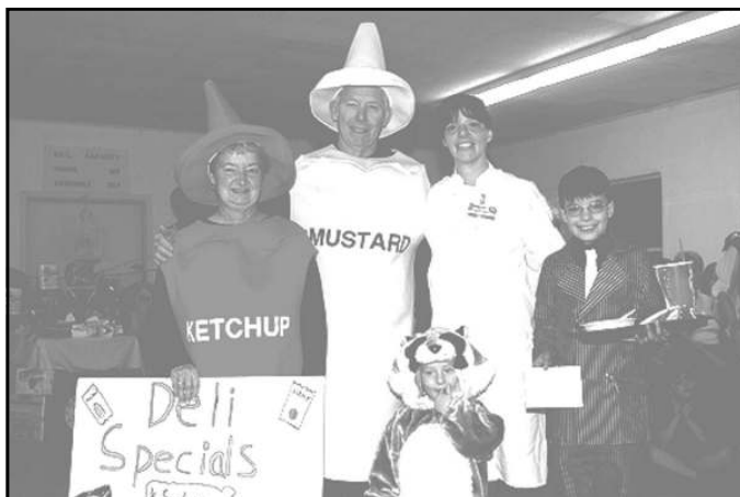
Halloween Costume Contest Participants